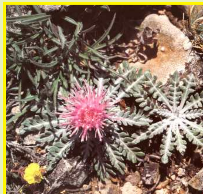
Cardo di Boccone